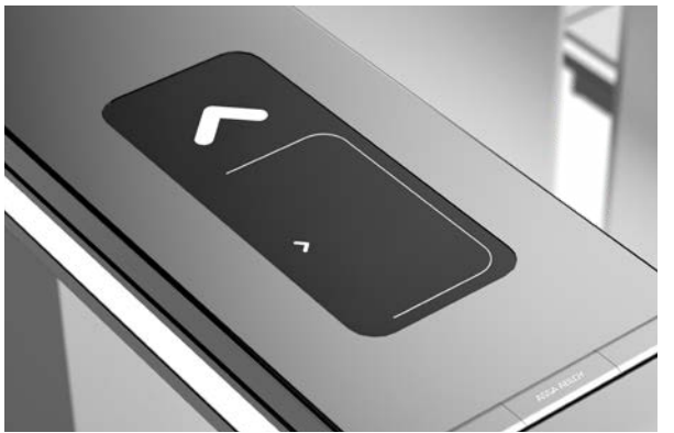
Card reader integration